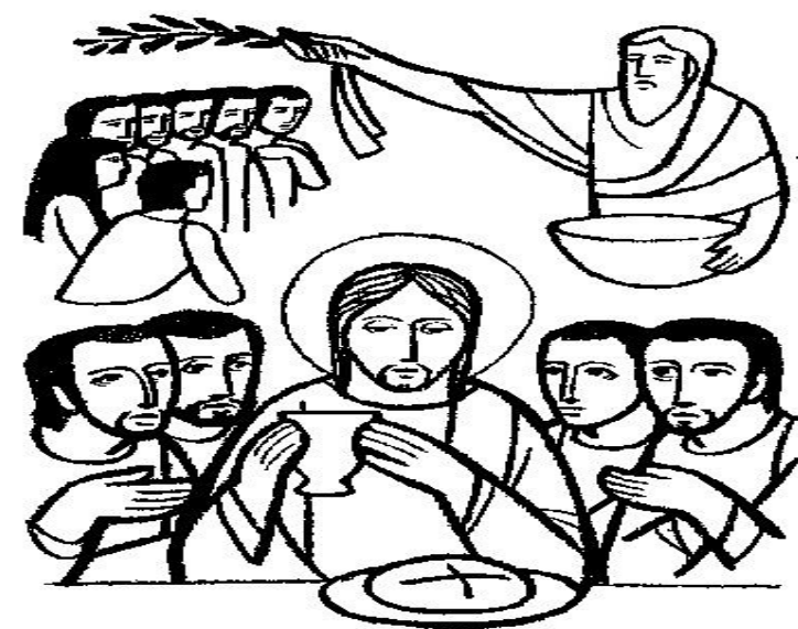
The Body and Blood of Christ

"They all ate as much as they wanted, and when the scraps remaining were collected they filled twelve baskets." The miracle of the five loaves and two fish distributed among so many people is given to us as a symbol of the greatest gift and miracle of all, the Eucharist. As God's people we are so privileged to be fed with the Body and Blood of Christ week after week, so much so that we can even take it for granted. We have a responsibility to keep the wonder of this gift alive in us. We also have the responsibility to live this miracle through our love for one another in our homes and communities. Through the power of Christ there was more left over after thousands of people had been fed than when they started. That is what the same Jesus wants to happen among us today as a result of the Eucharist we celebrate. Fr. Johnny Doherty, C.Ss.R.